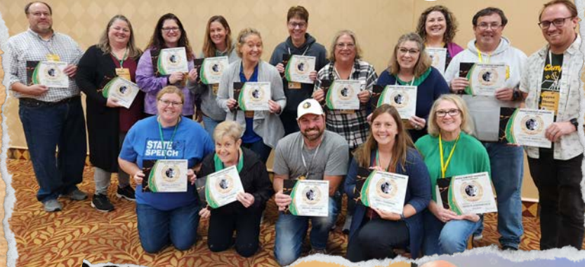
LG Contest Managers