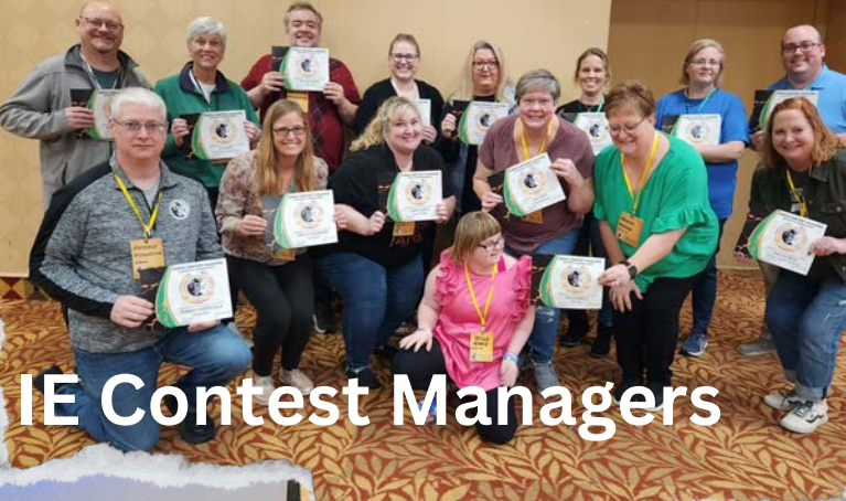
IE Contest Managers